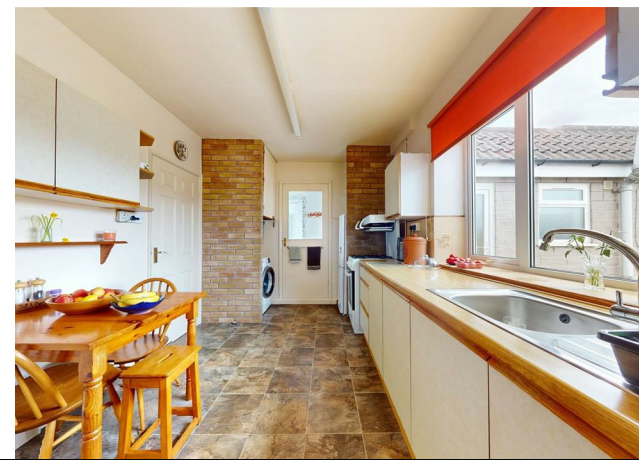
Beech Terrace, Radstock, Somerset BA3 3TH